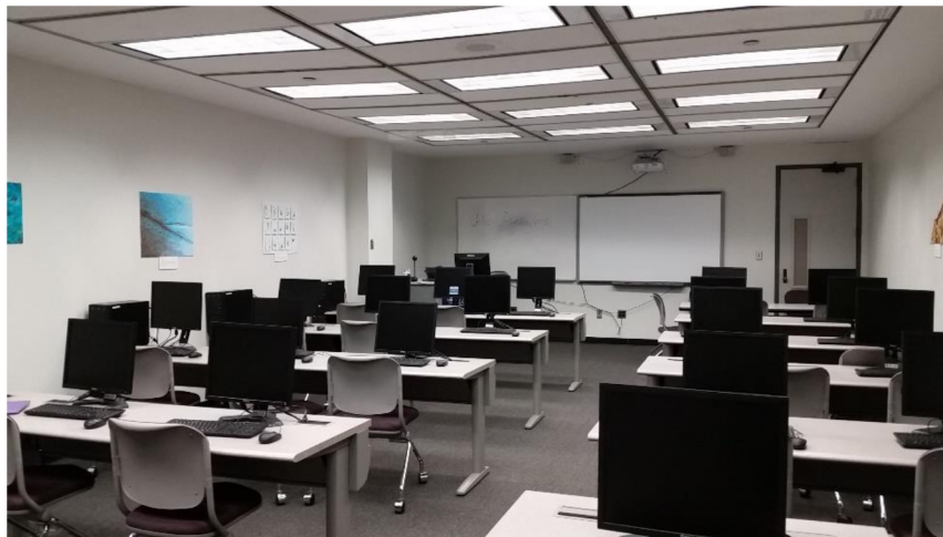
Figure 1. Current configuration of MSL L308, as viewed from the back of the classroom.

L308 Renovation - The third floor classroom, L308, in the Marston Science Library currently holds 22 workstations and an instructor podium with a Smartboard screen. The room is frequently used by classes taught by librarians and other department faculty, however due to its previous history as a copy room, it suffers from poor visibility and lack of workspace for students. Desktops and monitors consume most of the desk space and sightlines are especially poor for students sitting in the rear of the room, including students sitting at the ADA spot on the back row. (see Figure 1)