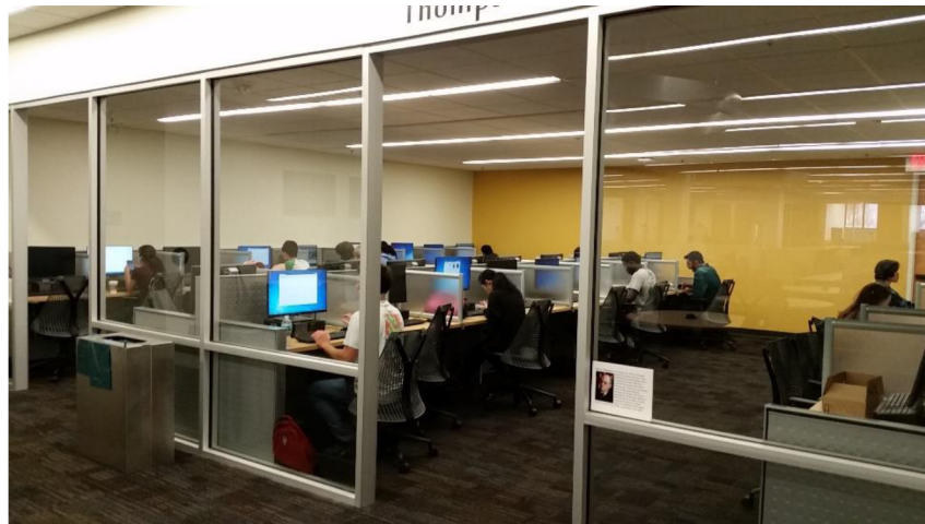
Figure 3. Thompson computer lab on 1 st floor of Marston Science Library

This new classroom will have four large display monitors mounted on two of the walls and one of the existing computers will be designated as the instructor workstation to provide projection of content using AirMedia. Similar to other campus computer labs, this space will remain open to students except when scheduled for a class.